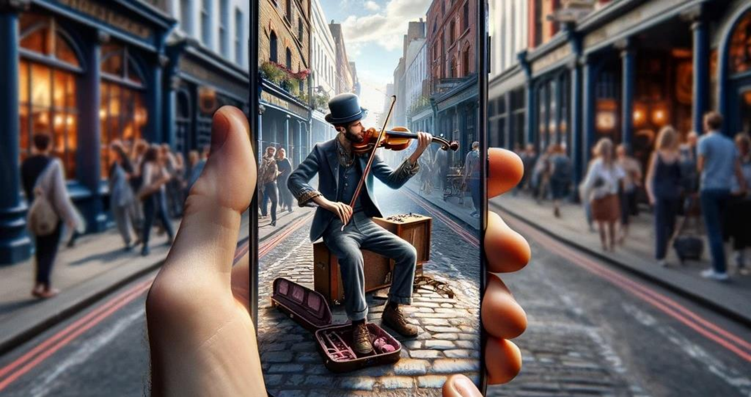
Augmented reality avatars. Digital street art.