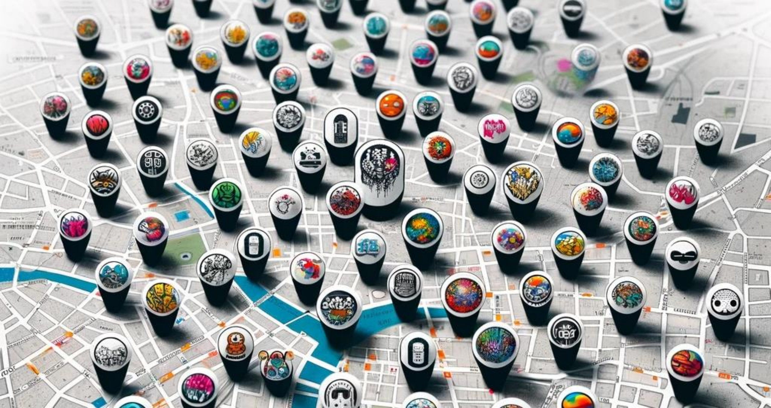
Street art route.